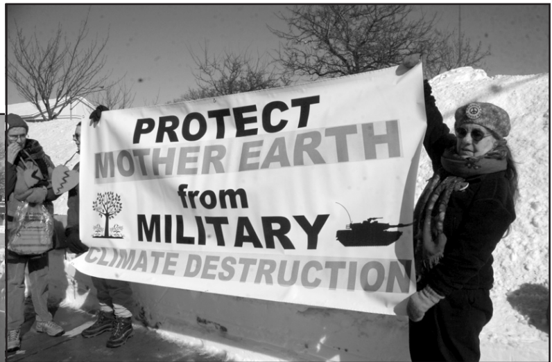
activists protest war and climate change in Albany, NY in Feb. 2014

Tuesday, November 5, 2019 7:00 PM Augustana Lutheran Church 2710 NE 14th #8 Bus line (NE 15th/Knott, enter in breezeway)